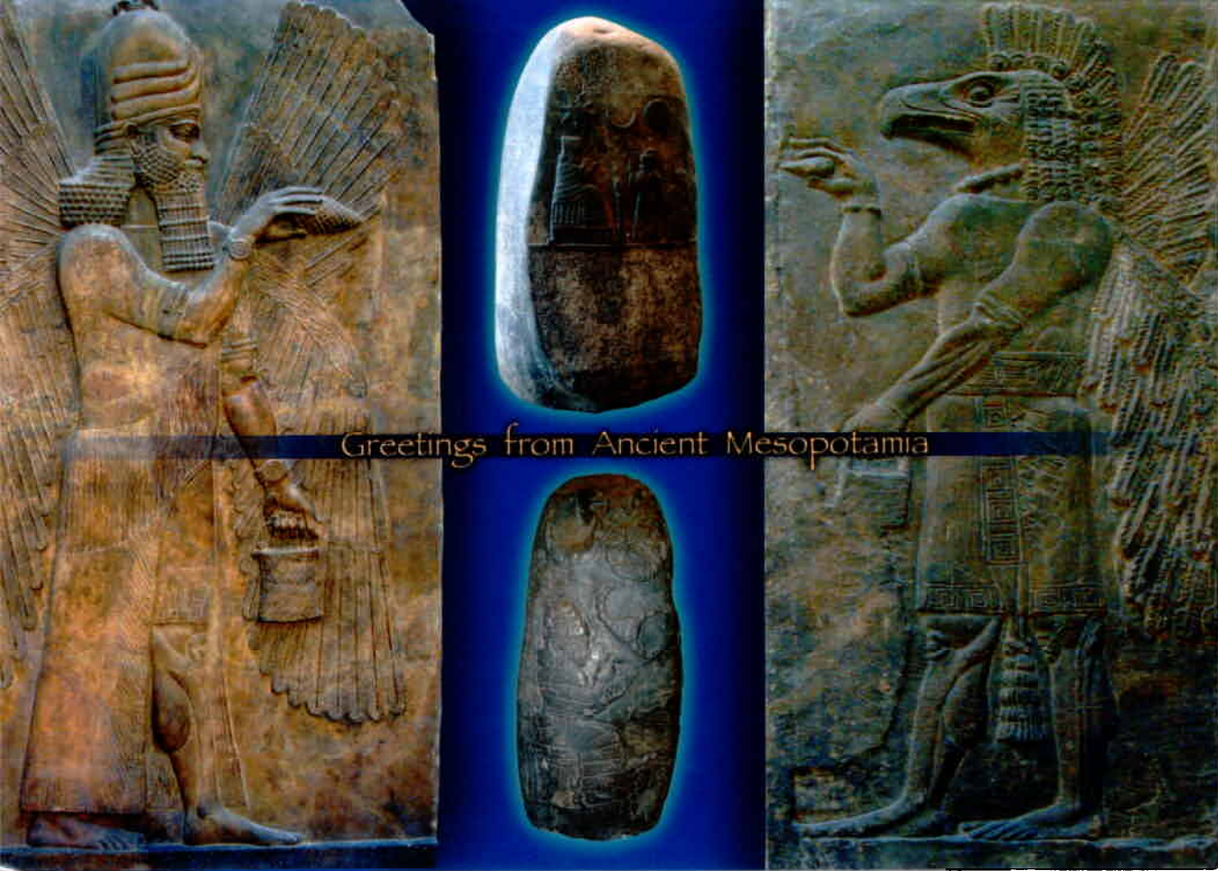
Greetings from Ancient Mesopotamia

REF: 519 Greetings from Iraq The Mesopotamian cradle of several ancient civilizations. Views of antic and present day art & architecture.